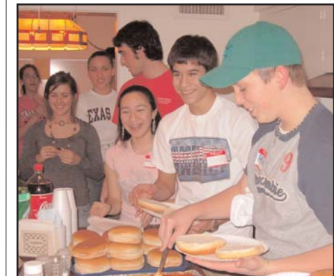
The Mardi Gras event brought smiles with lots of good food, bead catching during the parade, plus crawfish races, costume and limbo contests, dancing and a lot of fun!

In addition to special events, regular activities at 711 James Youth House (unless noted) include: Sunday - Upper Room worship Monday - 8th grade The Rock Praise and Worship @ Church Tuesday - High School Bible Study 9-12th