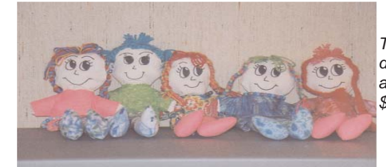
These cloth dolls are available at $5 each.

Members of JCDA made and sold cloth dolls to help fund JCDA service projects. The cloth dolls also helped those who purchased them. They were sold to employees of the Equal Employment Opportunity Commission, or EEOC, who sent the cloth dolls along with other items in care packages to U.S. Soldiers in Iraq. The soldiers were thrilled to receive the dolls! They wrote to EEOC stating how the dolls helped build trust with the Iraqi children and parents!